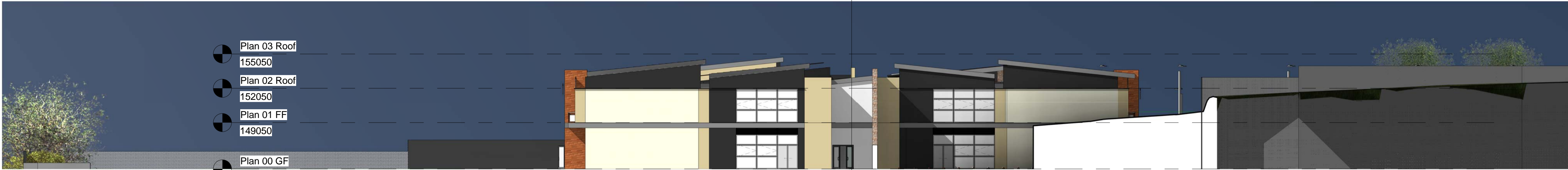
East 1 : 200