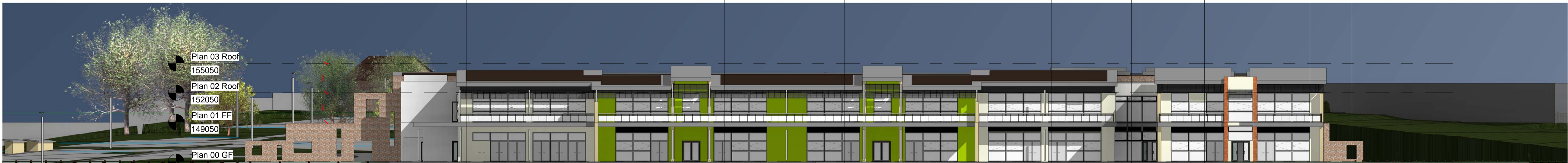
South 1 : 200