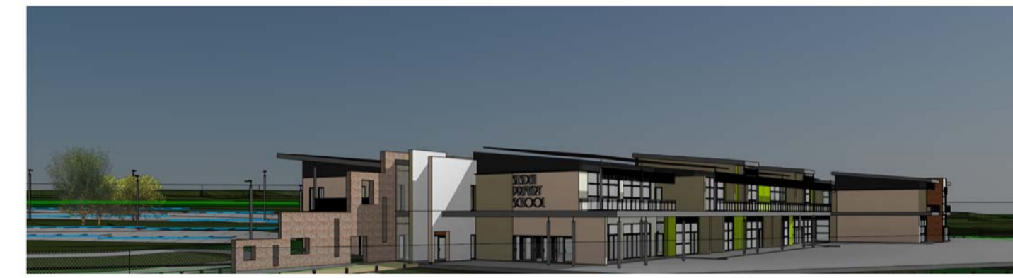
5 External Perspective 01