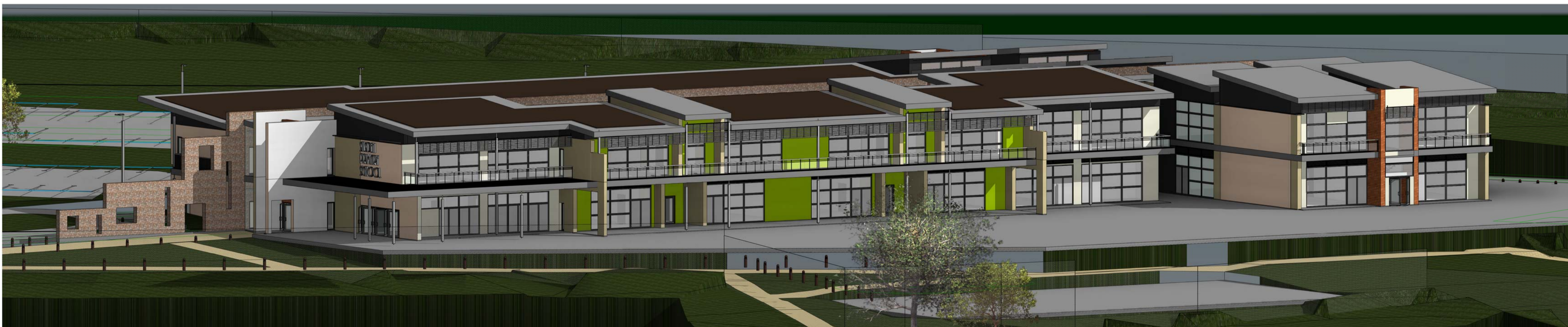
2 Building Zoom 02