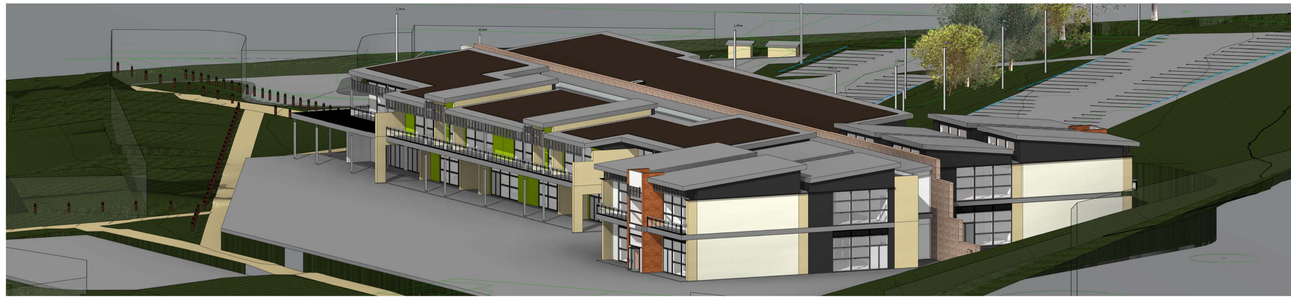
4 Building Zoom 04