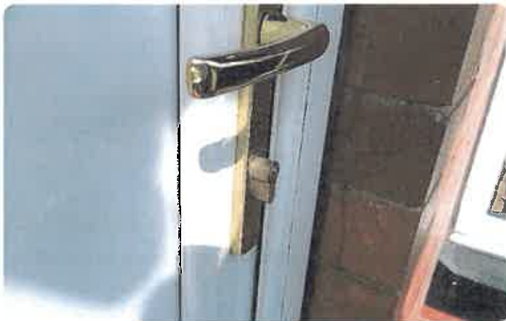
◀ Incorrectly measured lock protruding from the door handle

Contact your local Crime Reduction Officers for any further advice, simply call 101.